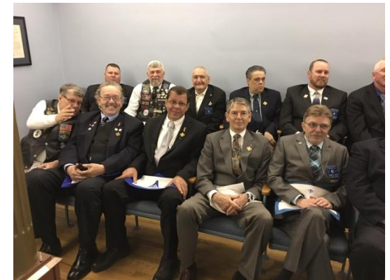
▲ Endeavor Brothers at Grand Visitation to Temple #9. ▼