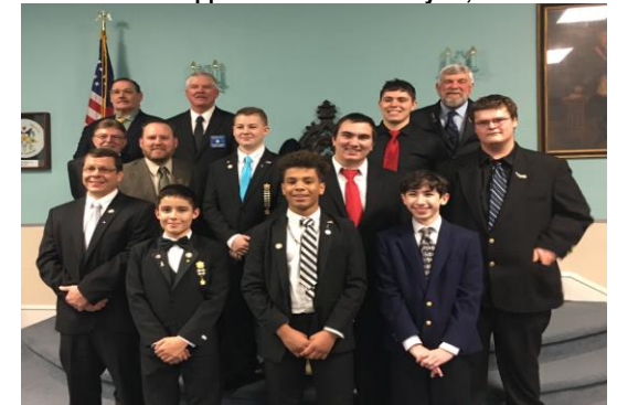
Six Endeavor Lodge #17 Members visited Jefferson Lodge #17 to attend a meeting of the Henlopen Chapter of DeMolay and witnessed these young men doing ritual.